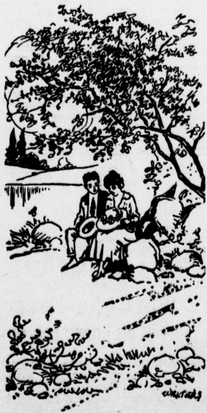
Were Sitting Together.

"There's a place over there where they dance-some of the less particular of the Vale people and a crowd of all sorts that come out here from town