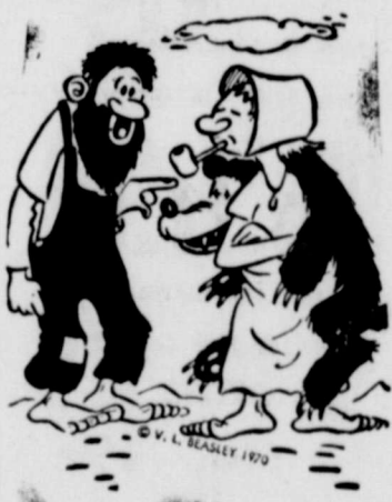
Granmaw, You Should Insure Yer New Fur Coat With