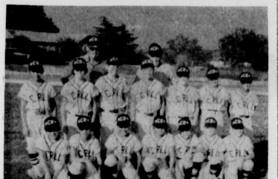
Colorado River Little League All Stars