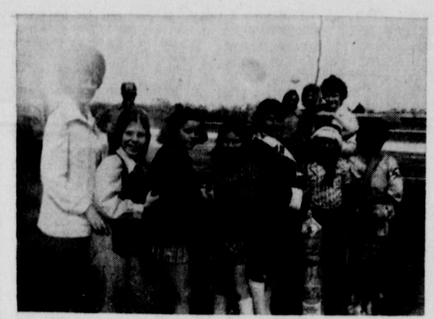
CONTRIBUTE TREE - Girl Scouts of Bronte planted a tree last week at the new track field of Bronte School. Last week was the 63rd anniversary of Girl Scouts