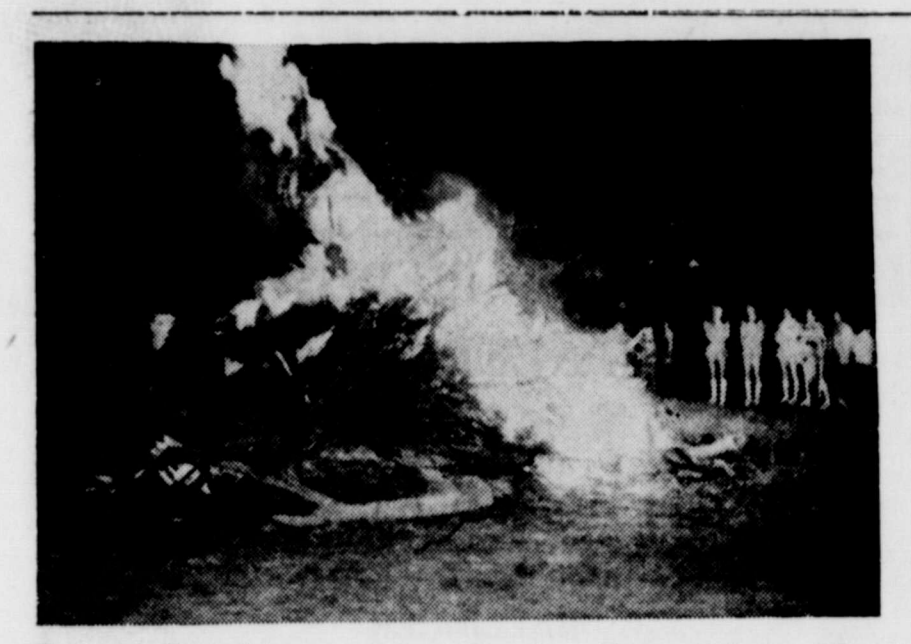
Rained Out Homecoming Bonfire Burned Last Week