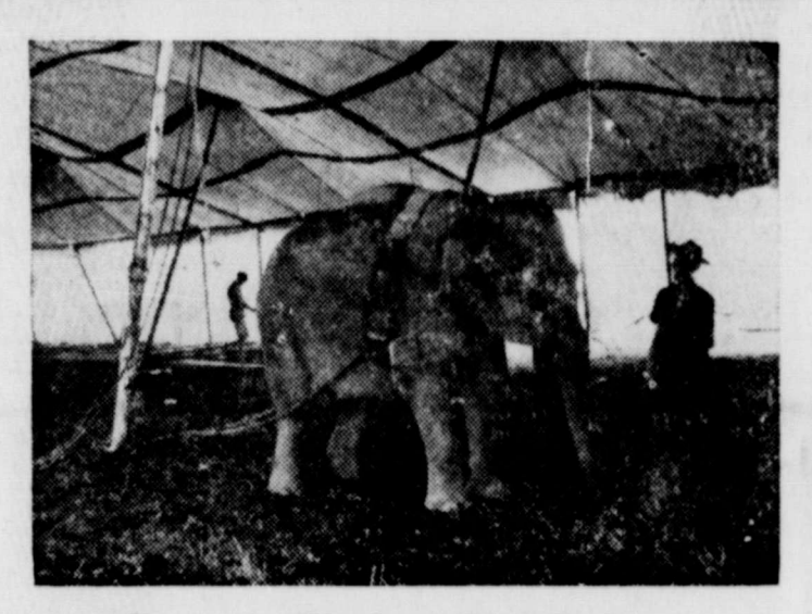
Dixie the Elephant Will Be Here