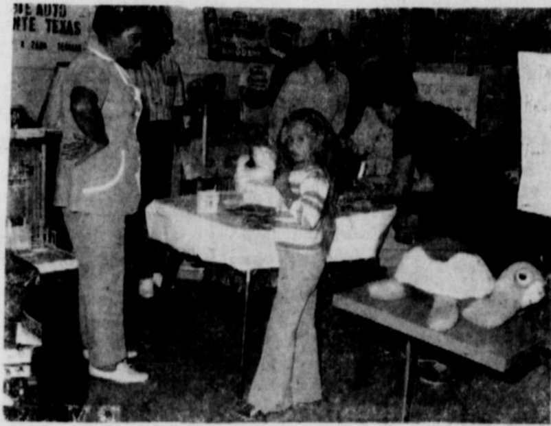
White Auto's Booth at the Fair

Praise for Coke County's First Annual Fair was running rampant this week, after approximately 900 persons attended the exhibition last Friday and Saturday. More than 450 individual exhibits were set up for public viewing in the old gym at Robert Lee School.