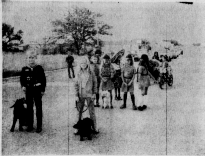
Part of the Youth and Pet Parade