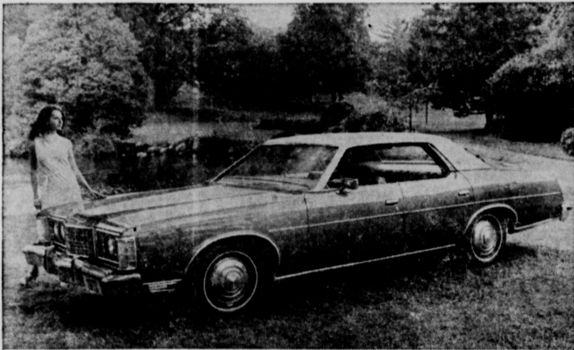
Most changed Ford Division car for 1973 is the full-sized Ford. Shown here is the LTD four-door hardtop. All-new sheet metal below the window line and a new segmented grille give the 1973 Ford a more formal look. All 1973 Fords have a new impact-absorbing bumper system, although the overall length of the car is increased only about one inch. Power front disc brakes, power steering, SelectShift Cruise-O-Matic transmission and a 351-2V eight-cylinder engine are standard in all new Fords.