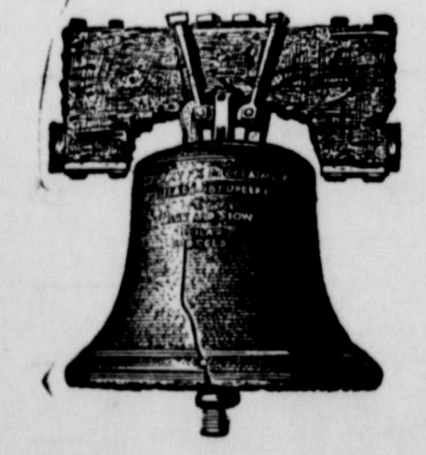
Buy U.S. Savings Bonds