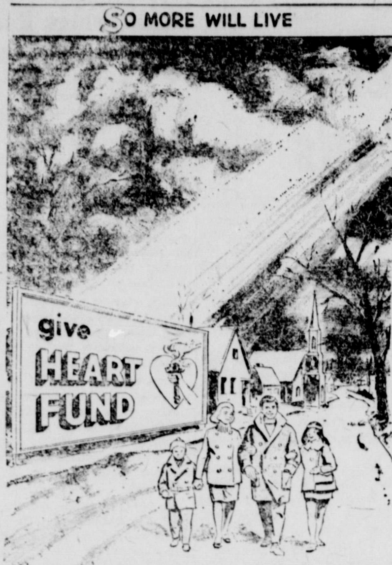
New Rays of Hope for All Hearts