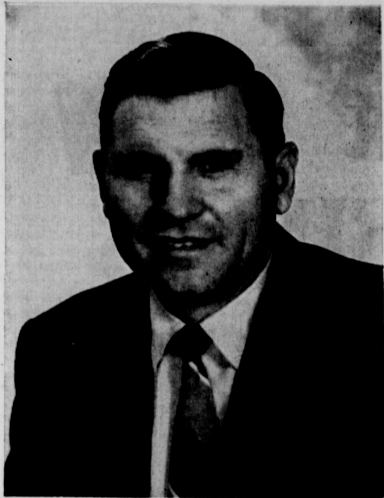
Gov. Bruce King