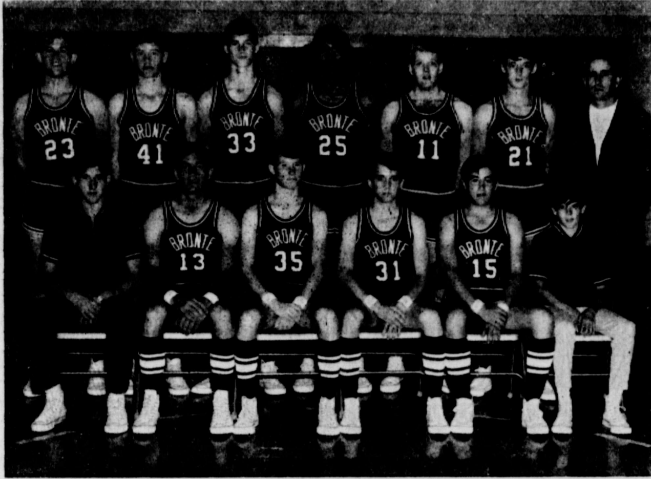
The 1970 Longhorn Basketball Team