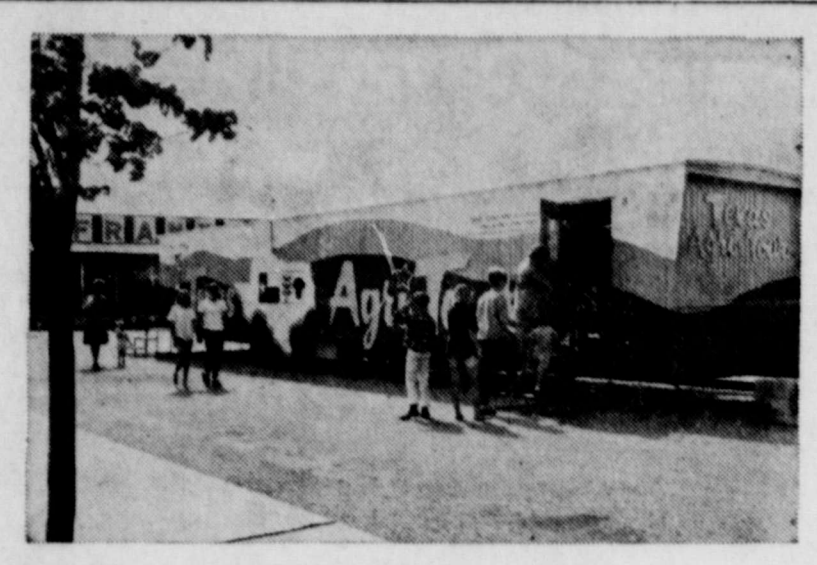
Agri-Tour Mobile Unit