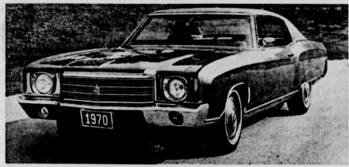
A new concept of elegance is the distinctive Monte Carlo Sport Coupe. This newest addition to the Chevrolet line is characterized by smooth flowing lines and sculptured surfaces dramatically emphasized by the longest hood ever produced by Chevrolet. The plush interior includes a simulated wood burl accent on the instrument panel and extra-thick foam cushioned front and rear seats. The Monte Carlo will be at dealerships on September 18.