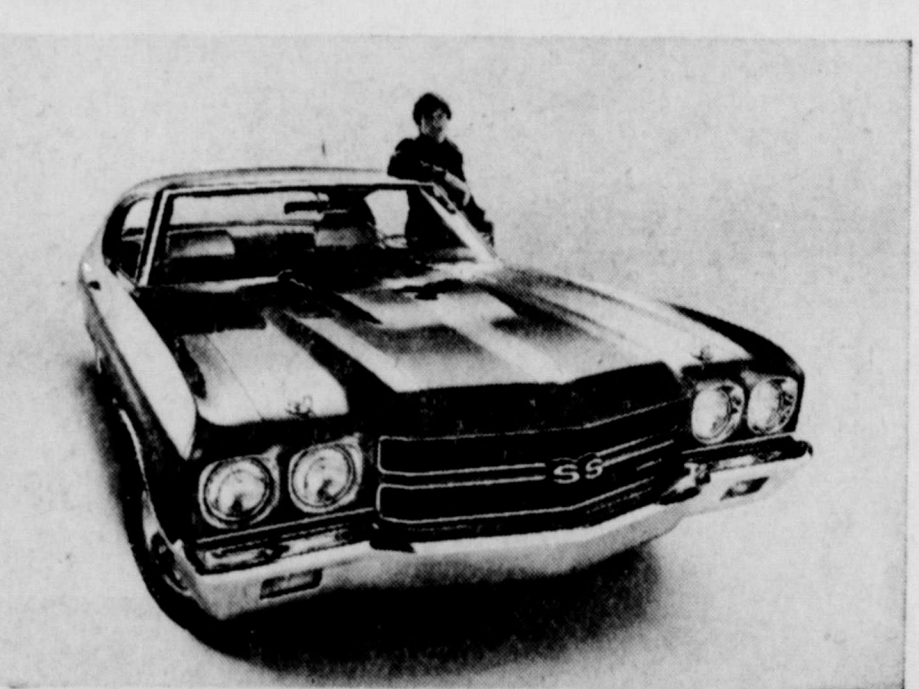
Our tough one: Chevelle SS 396

Monte Carlo. Our whole new field of one.