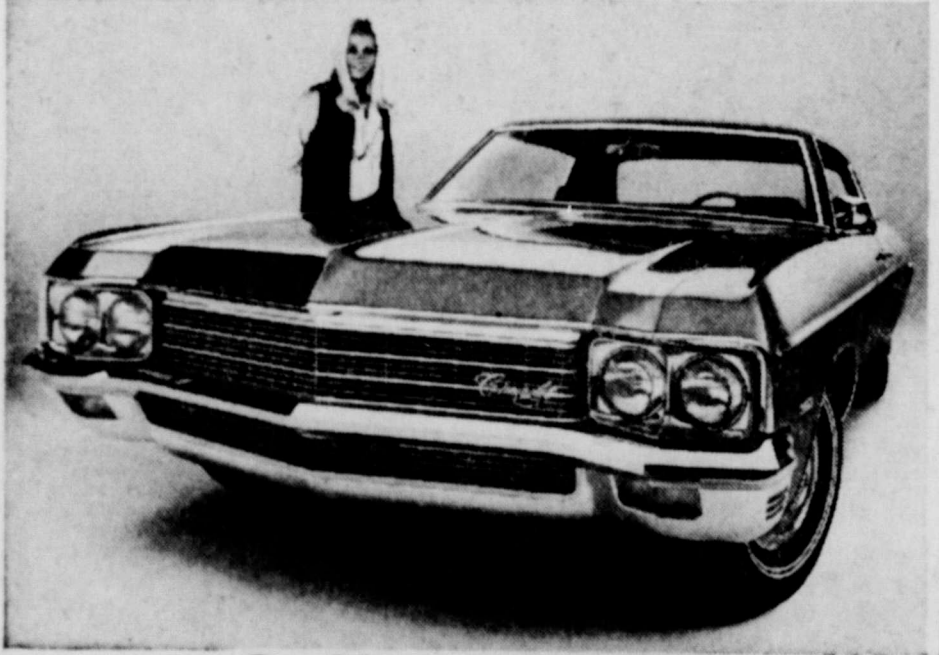
Our big one: Caprice