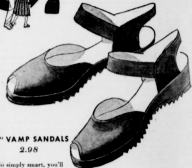
"V" VAMP SANDALS 2.98

So simply smart, you'll wear them all summer. Cool, durable twill uppers, easy walking platform soles, ankle straps woven with Laxtex. Seven spanking colors: Magic red, Chive green, Cork tan, Peacock, Cloud white, Fashion black, Copper.