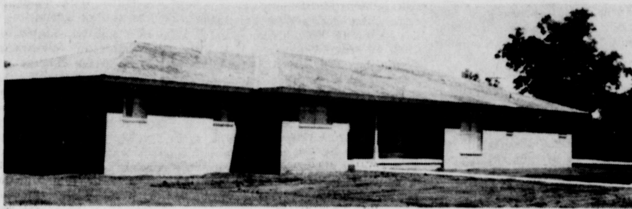
New Baptist Parsonage