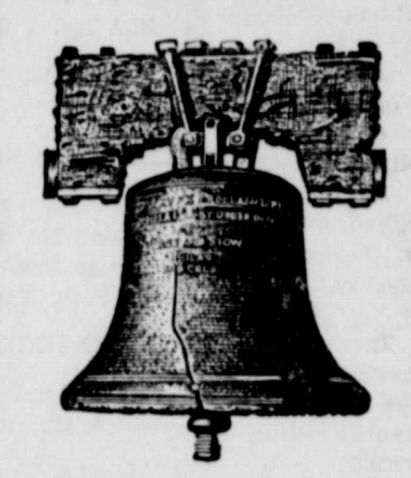
Buy U.S. Savings Bonds Now Pay 4.15% To Maturity