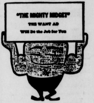
THE BRONTE ENTERPRISE