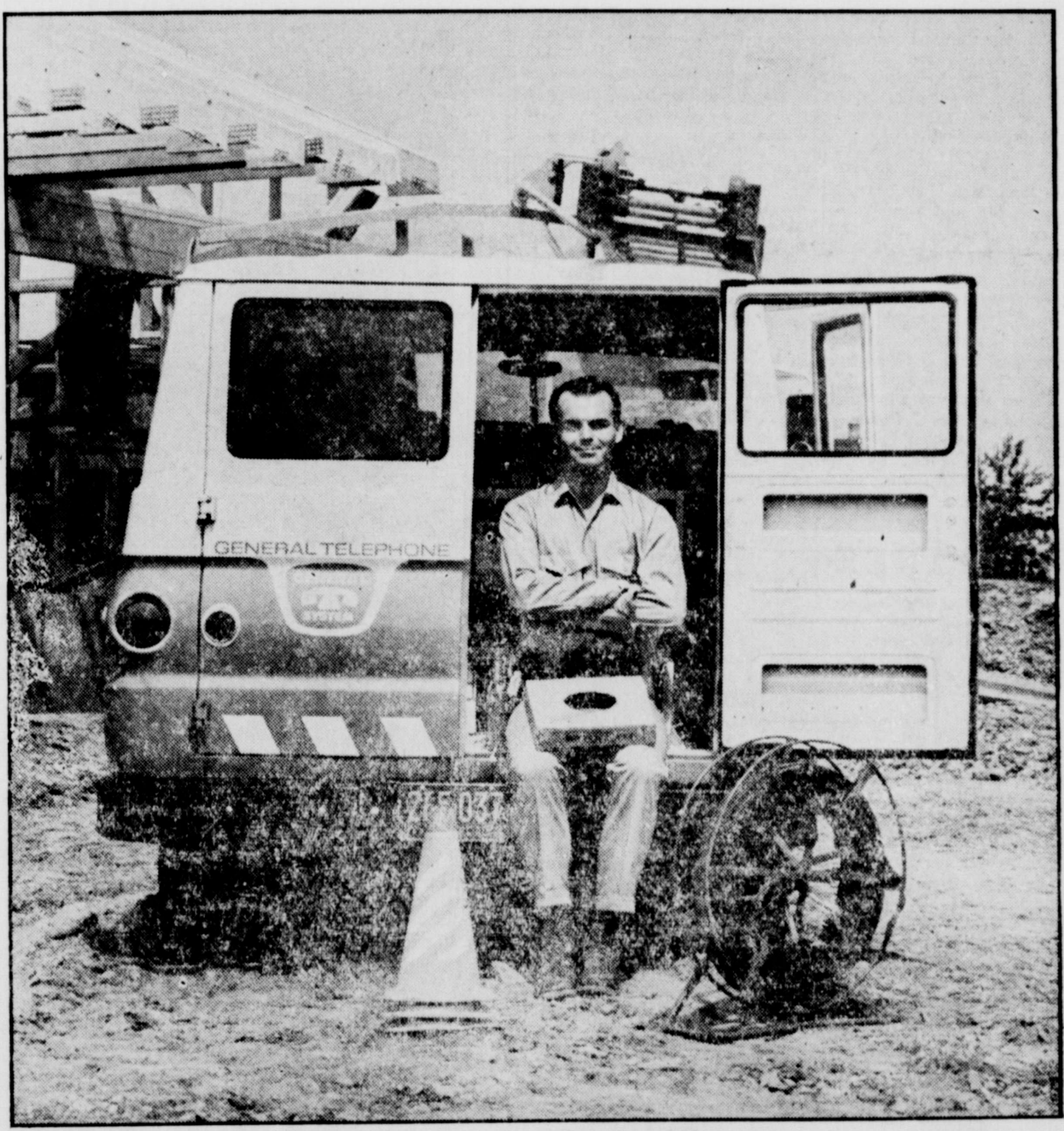
One of our busiest offices.

He's an installations expert, a crackerjack repairman, a walking catalog and an interior decorator.