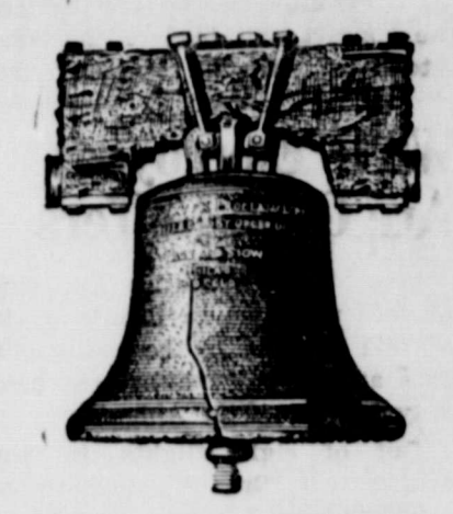
Buy U.S. Savings Bonds Now Pay 4.15% To Maturity