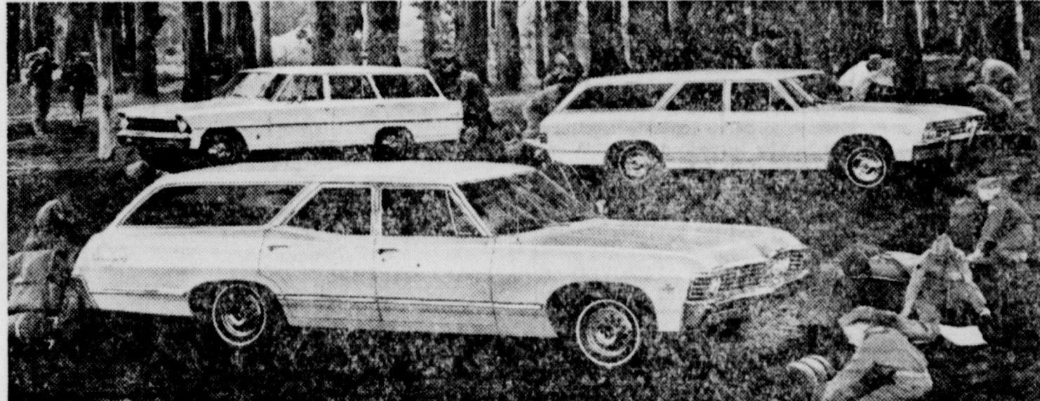
Top left: Chevy II Nova Station Wagon. Foreground: Chevrolet Impala Station Wagon. Top right: Chevelle Malibu Station Wagon.

Chevrolet Impala, roomiest in its class. While extra roominess is perhaps the best reason for buying a Chevrolet wagon, consider, also, these bonuses: Body by Fisher, Chevrolet dependability, flush-and-dry rocker panels and Magic-Mirror finish. Chevelle Malibu, smoother, quieter ride. A Malibu not only gives you a Full Coil suspension ride, but the body mountings are double-cushioned. And Chevelle carries plenty. It opens wide. 54.6 inches, to be exact, 28.5 inches high. Flip the second seat down and you've got 86 cubic feet of cargo space for all your gear. Chevelle was built to take a lot. Chevy II Nova, best equipped for the money. All-vinyl upholstery is standard. Flush-and-dry rocker panels that clean themselves are standard. Separate panels beneath each fender to inhibit rust are standard.