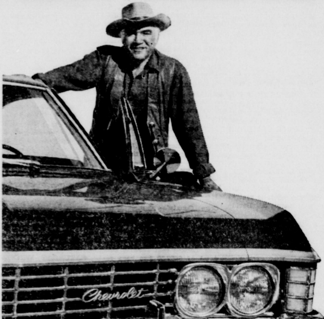
Watch Lorne Greene, star of Chevrolet's "Bonanza", each Sunday night on NBC-TV.