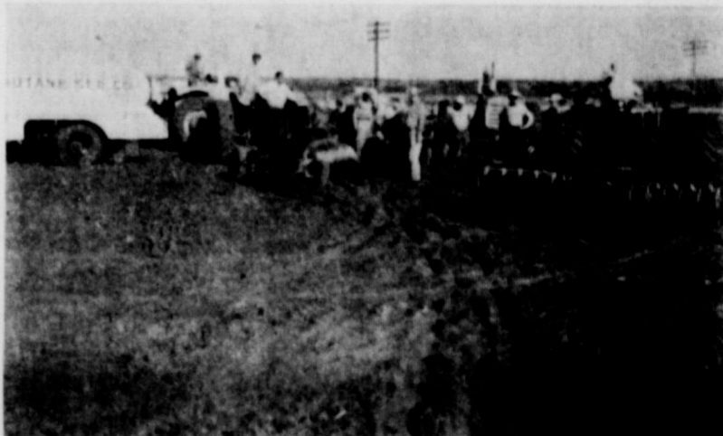
ALL FINISHED — Five tractors, their operators and other persons who were helping lined

have their pictures made. They kept right on moving and did a good job which was completed by five o'clock.