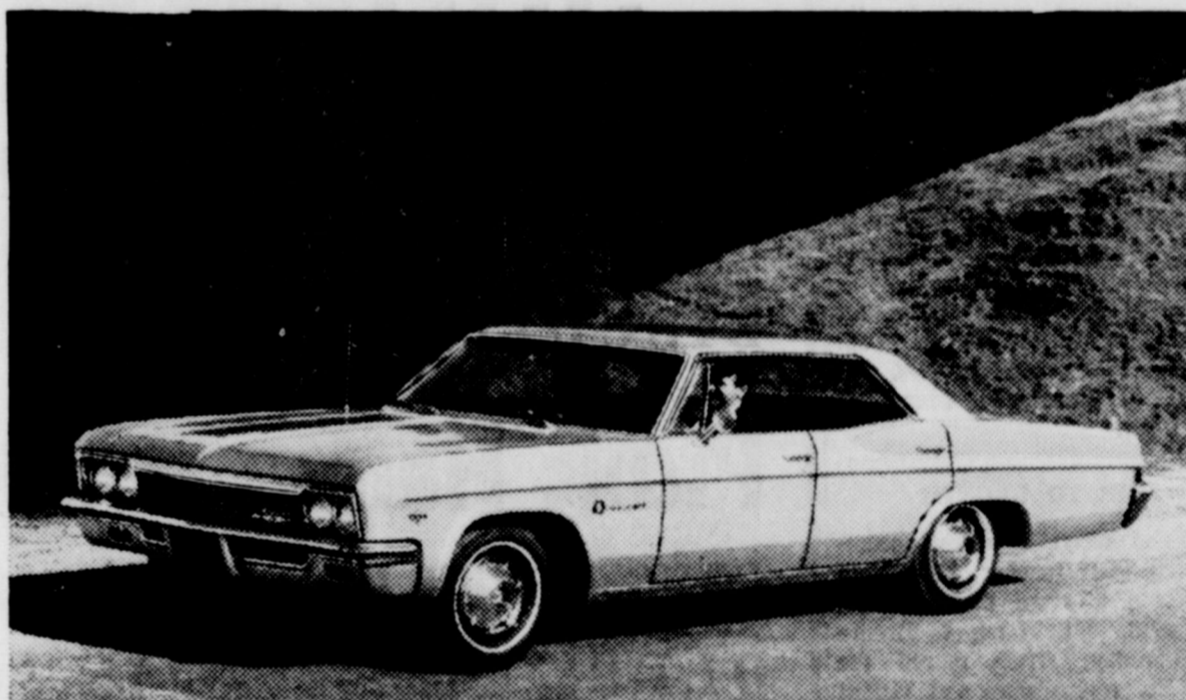
1966 Impala Sport Sedan—a more powerful, more beautiful car at a most pleasing price.

If you haven't examined a new Chevrolet since Telstar II, the twist or electric toothbrushes,