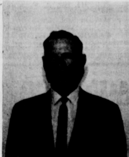
Judge W. W. Thetford