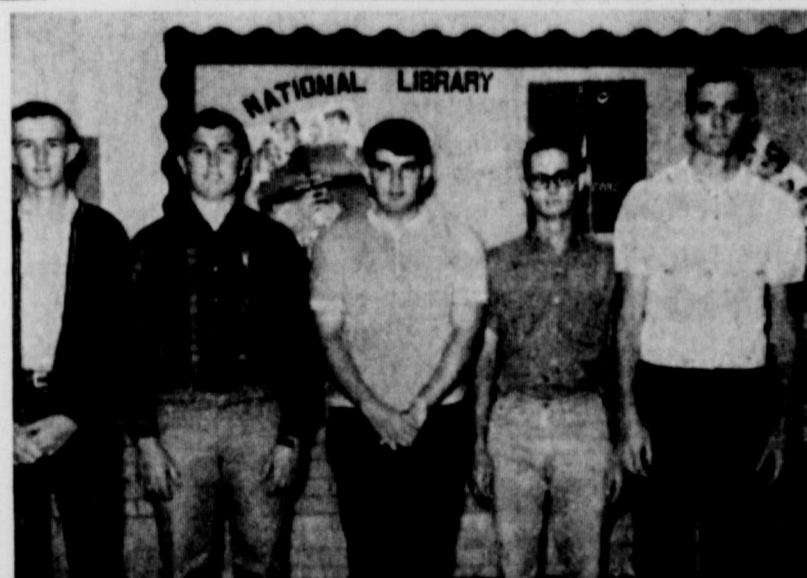
TEE OFF TODAY — Bronte High School's golf team won second in district and will compete in regional contests in Big Spring