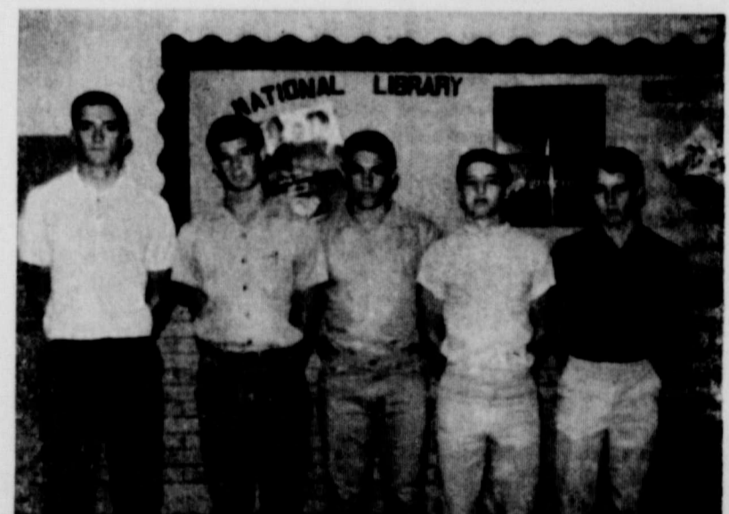
TRACKMEN — Bronte High School's track team members who won district honors and will compete Saturday at the regional