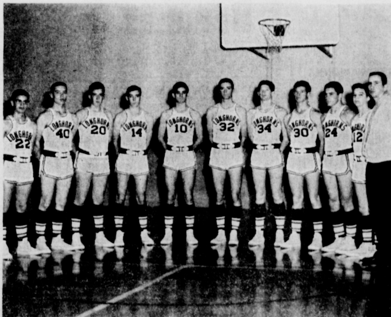
HEADED FOR REGIONAL — Members of the 1966 Bronte Longhorn basketball squad, champions of District 67-B and owners of a berth in the Region VI tournament this weekend at Big Spring.