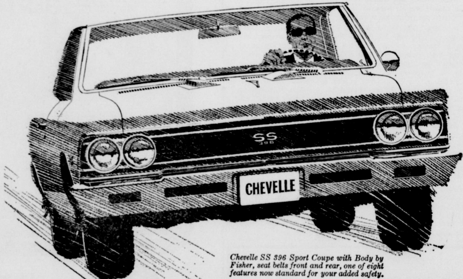
Chevelle SS 396 Sport Coupe with Body by Fisher, seat belts front and rear, one of eight features now standard for your added safety.

For the guy who'd rather drive than fly: Chevelle SS 396