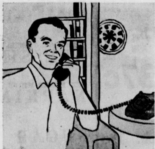
ANOTHER TELEPHONE IN THE DEN