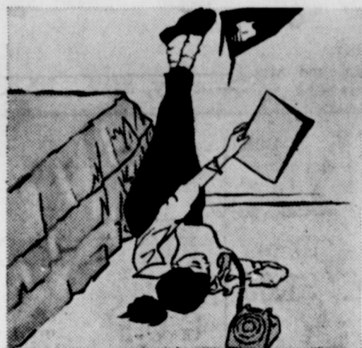
ANOTHER TELEPHONE FOR TEEN-AGERS