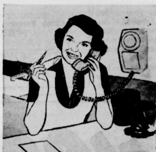
ANOTHER TELEPHONE IN THE KITCHEN

You don't have to run, when you have more than one