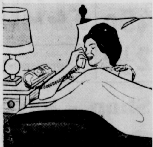
ANOTHER TELEPHONE IN THE BEDROOM

ADD-A-PHONE MONTH . . . get yours now for modern time-saving convenience