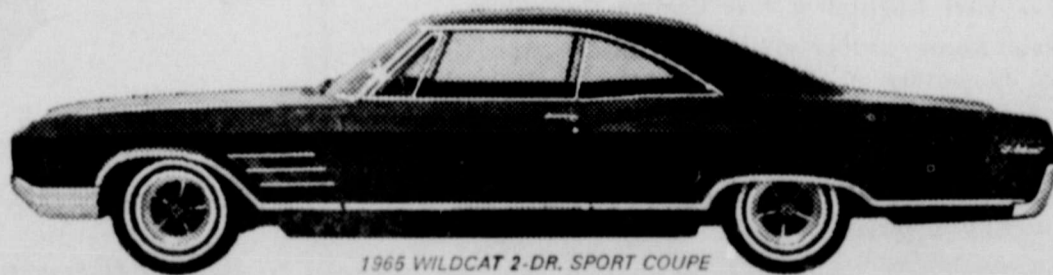
1965 WILDCAT 2-DR. SPORT COUPE

And you'll soon be driving the car you waited for.