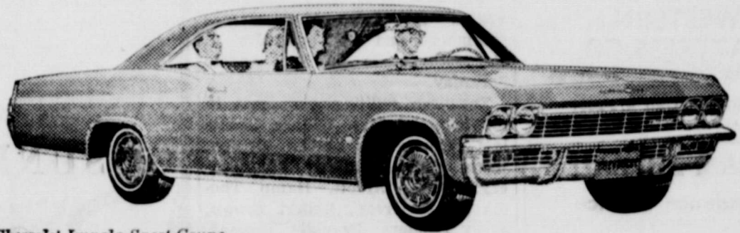
'65 Chevrolet Impala Sport Coupe

So place your order now for delivery on the beautiful new kind of '65 Chevrolet that's right for you!