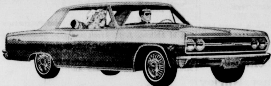
'65 Chevelle Malibu Super Sport Coupe

'65 Chevrolet Impala It's longer, lower, wider—with comforts that'll have many expensive cars feeling a bit envious.