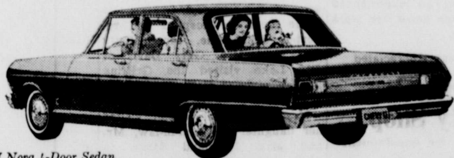
'65 Chevy II Nova 4-Door Sedan

'65 Chevelle Malibu It's smoother, quieter—with V8's available that come on up to 350 hp strong. That's right—350.