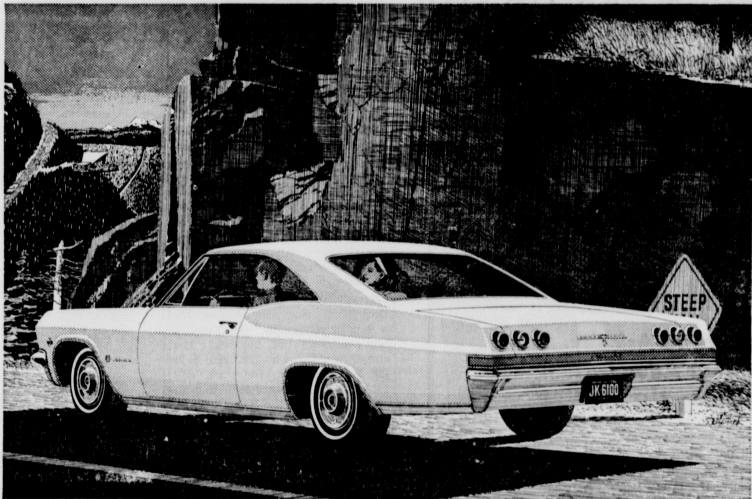
'65 Chevrolet Impala Sport Coupe—with new Sweep-line roof.

If what you see moves you, wait'll you take the wheel