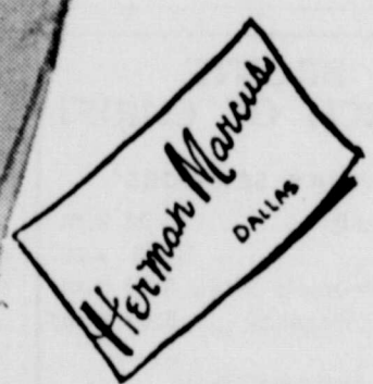
A lovely silhouette complimented by a stunning, tasseled tie belt. From Herman Marcus to you in acetate and rayon crepe.