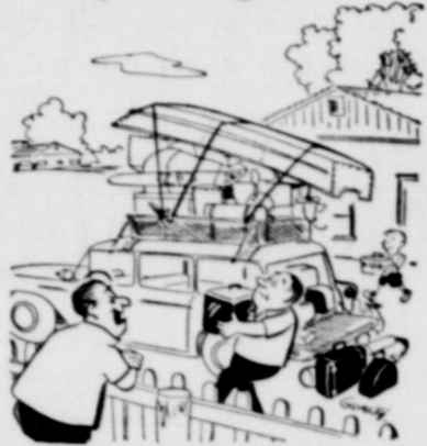
"Planning a trip?"