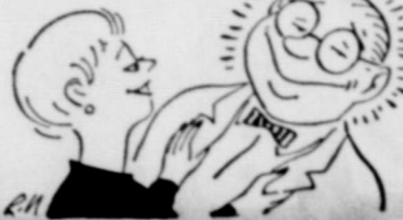
"A man is never so weak as when a pretty girl tells him how strong he is."