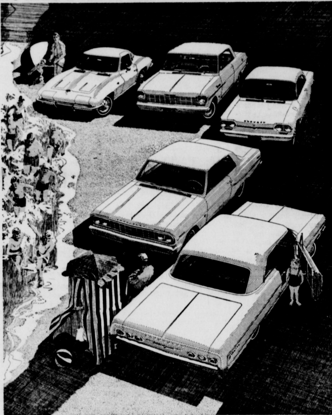
Sport Coupes above: Corvette Sting Ray, Chevy II Nova, Corvair Monza, Chevelle Malibu, Chevrolet Impala.