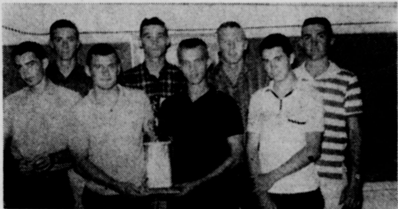
TRACK TEAM — Here are members of the Bronte Longhorn track team who qualified to participate in the regional meet this weekend at Howard County Junior College in Big Spring.