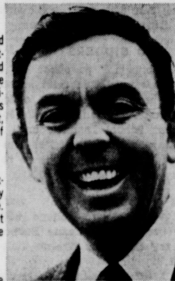
GORDON McLENDON Democratic Candidate For U. S. Senator

• FOREIGN AFFAIRS —The Monroe Doctrine should be firmly restated and upheld.