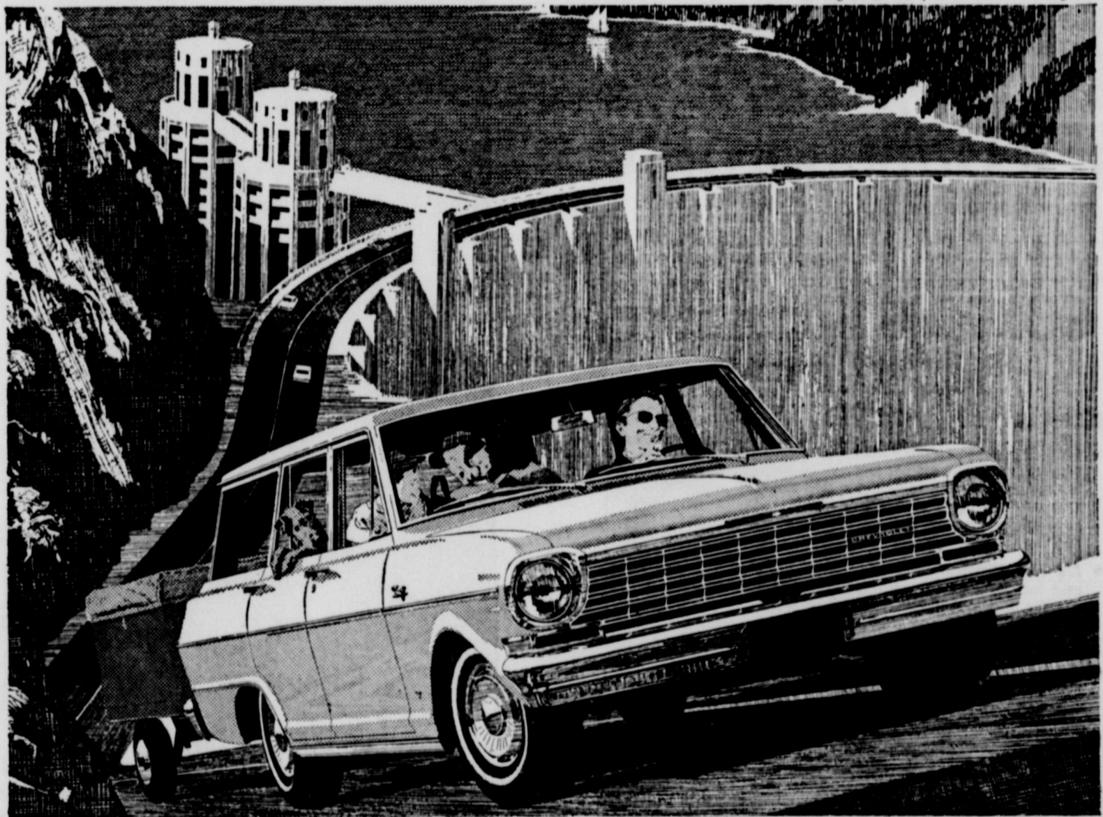
Chevy II Nova 4-Door Station Wagon

CHECK THE T-N-T DEALS ON CHEVROLET • CHEVELLE • CHEVY II • CORVAIR AND CORVETTE NOW AT YOUR CHEVROLET DEALER'S