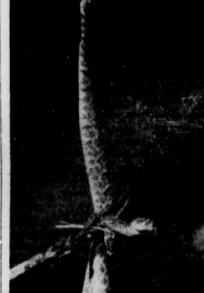
big rattler caught in the rattlesnake roundup last weekend, is hanging up for the killing stroke of the butcher. Dozens of the rattlers were butchered, fried and sold to spectators at the snake show in Robert Lee. Most persons who ate the meat said it was good.