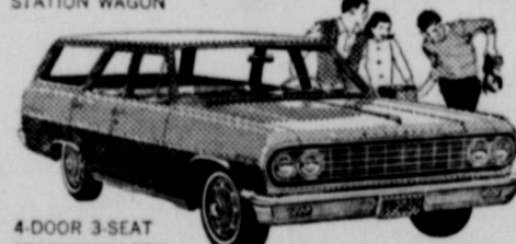
4-DOOR 3-SEAT STATION WAGON