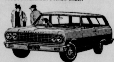
2-DOOR 6-PASSENGER STATION WAGON