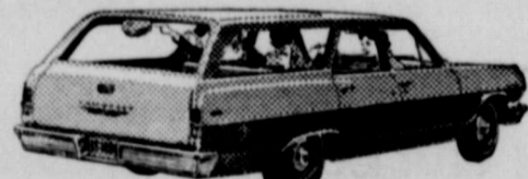
4-DOOR 6-PASSENGER STATION WAGON