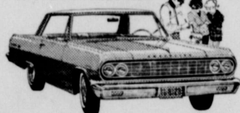
SUPER SPORT COUPE