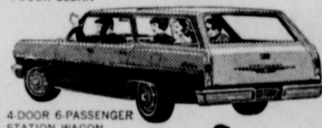
4-DOOR 6-PASSENGER STATION WAGON