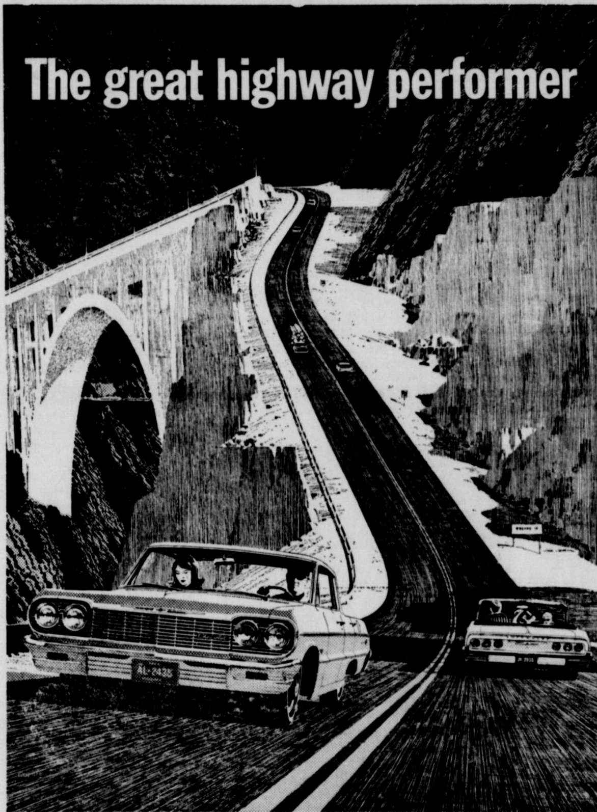
'64 Chevrolet Impala Sport Sedan and (background) Impala Convertible

"Work and cooperation" are the best qualities to contribute to a long and happy married life, according to the couple.