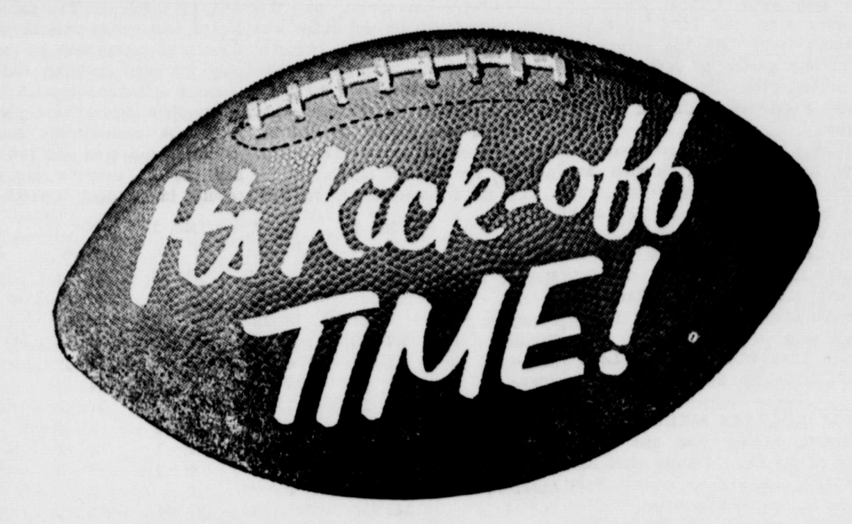
Bronte Longhorns VS.