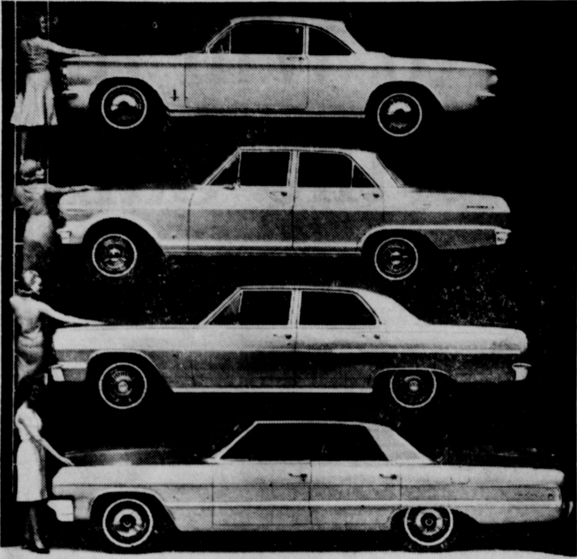
For 1964, the Chevrolet Motor Division will offer a total of 43 models in five separate passenger car lines. Each line is distinguishable by its own styling and wheelbase. Above, reading down: the 108-inch wheelbase Corvair Monza Coupe; 110-inch wheelbase Chevy II Nova 4-Door Sedan; the newest car in the Chevrolet family—the Chevelle Malibu 4-Door Sedan which has a wheelbase of 115 inches while the Chevrolet Impala Sport Sedan is built on a 119-inch wheelbase. Not shown is the Corvette Sting Ray which sports a 98-inch wheelbase. Chevrolet dealerships will have a representative showing of all models when the new cars are introduced September 26.