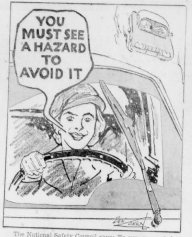
The National Safety Council says: Be sure your windshield wiper blades and arms are in perfect condition. You need one ounce of arm pressure for each inch of rubber blade length to sweep off rain or mud spray. Instead of sliding over it and causing poor visibility.