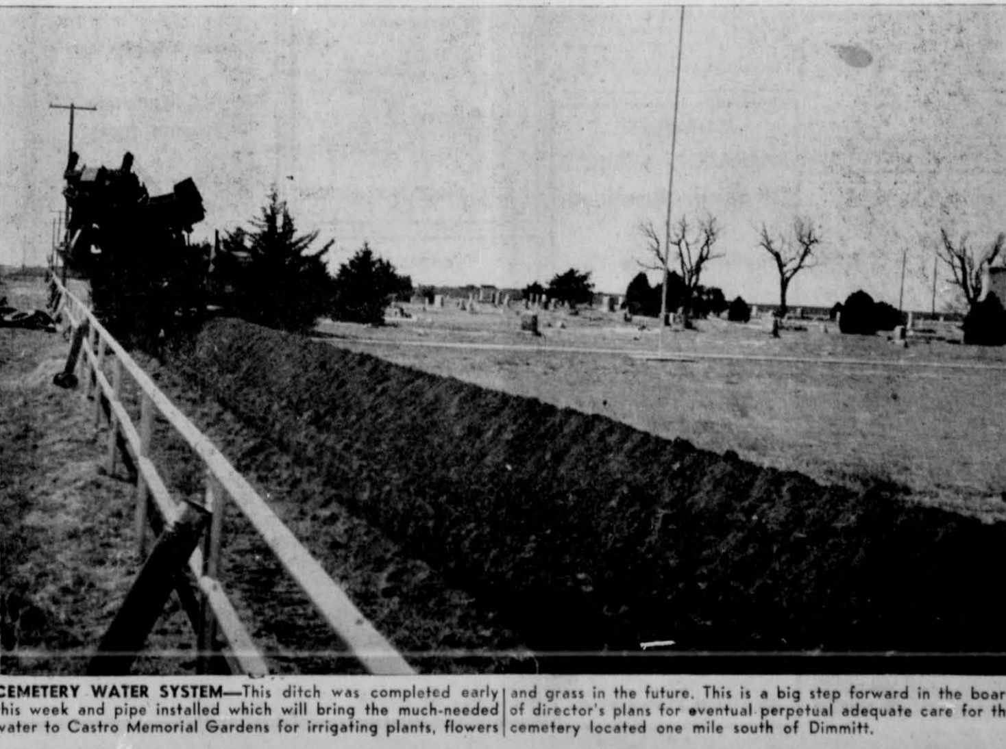
CEMETERY WATER SYSTEM—This ditch was completed early this week and pipe installed which will bring the much-needed water to Castro Memorial Gardens for irrigating plants, flowers and grass in the future. This is a big step forward in the board of director's plans for eventual perpetual adequate care for the cemetery located one mile south of Dimmitt.

This was one of the steps by the Cemetery Association Board of Directors towards long-range beautifying of the cemetery. A part-time caretaker has been hired for some time under the perpetual care program. Under this system donations are made to the Association to be invested. Interest from these investments is used to pay expenses of caring for the cemetery. Many families have been paying $50 per grave for this perpetual care and others $2 per year for annual care. These funds, with donations, supply the money necessary for maintenance.