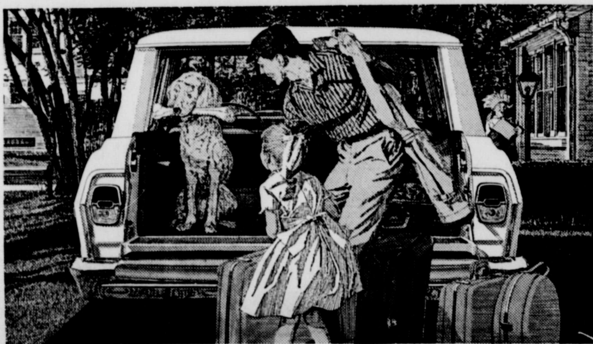
Chevy II Nova 400 6-Passenger Station Wagon