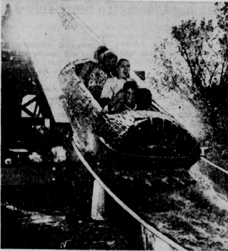
Fantastic new $300,000 Log Flume ride at Six Flags unveiled Tuesday, lives up to all advance expectations. Named the Aseradero it is the only one of its kind in the world. The faces of the passengers aboard this eight foot hollowed out log reflect the thrilling climax down a 44-foot incline at speeds exceeding 10 feet per second into a trough filled with swirling rapids.