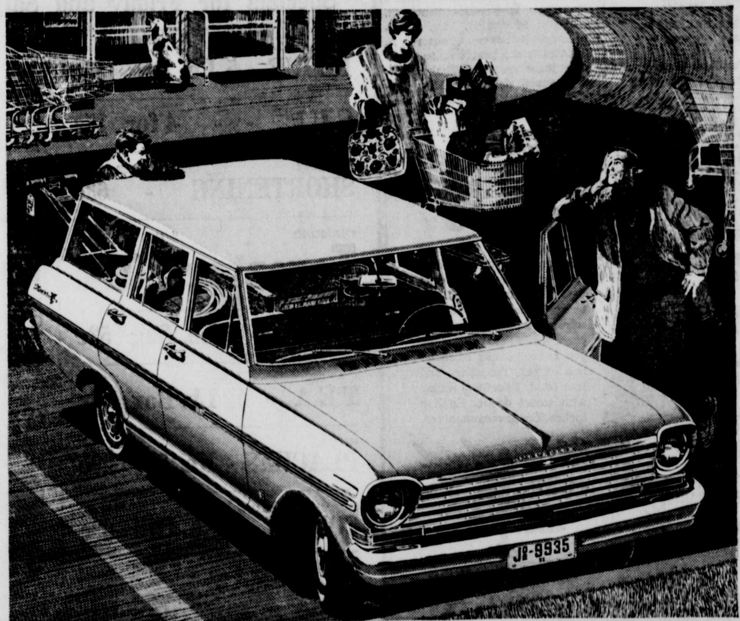
Nova 400 4-Door 6-Passenger Station Wagon

this one goes and goes on a gallon. They grow with brakes that adjust themselves. An exhaust system that lasts longer. And a Delcotron generator that keeps battery reserve power up. Want to hear more? How about a low price, natty interiors, Body by Fisher craftsmanship -and a talk with your Chevrolet dealer soon!