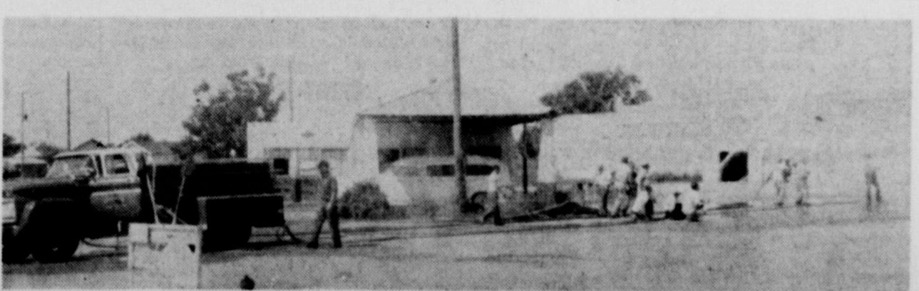
Firemen Have a Field Day with New Truck

Plans are being made for the Coke County Girls 4-H Camp to be held August 23 and 24. I hope all the girls will mark this date and begin now to make plans to attend. Crafts and recreation will be taught and enjoyed by the campers. Each girl will receive a letter soon with all the details.