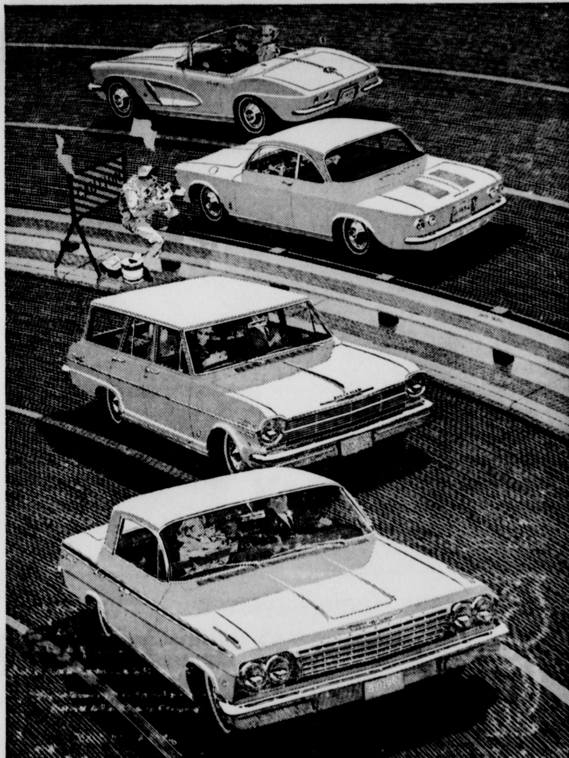
Four Sun 'n' Fun ways to get away (shown top to bottom) are the Corvette, Corvair Monza Coupe, Chevy II Nova Station Wagon and Chevrolet Impala Sport Sedan.

Now, beautiful buying days at your local authorized Chevrolet dealer's Golden Sales Jubilee!