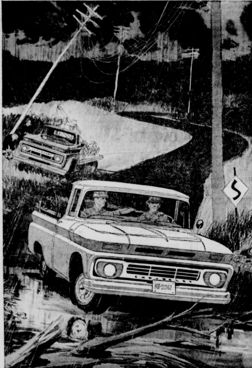
Above: 2-Ton Cab-Chassis. Below: 1/2-Ton Fleetside Pickup.

Its reliability is probably its greatest single asset