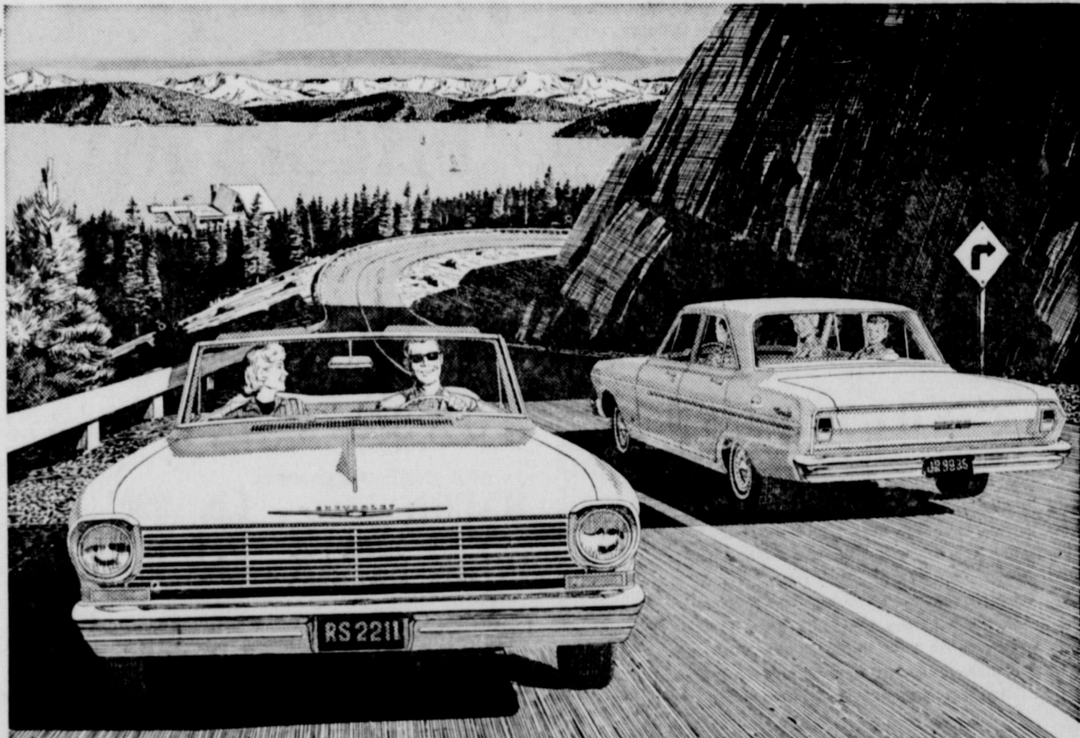
The sporty Chevy II Nova Convertible and sprightly 4-Door Sedan

See the new Chevy II at your local authorized Chevrolet dealer's