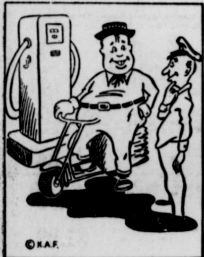
"Fill'er up.....one pint."

One pint or a full tank...one quart or a crankcase drain...it makes little difference to us. Drive in for free battery check-up or for air in your tires. We want to serve you.