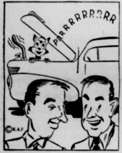
Told you I'd have it purrin' like · Kitten.

It takes good gasoline, the proper oil to keep a motor running in top shape to make it "purr." For lubrication and car washing too