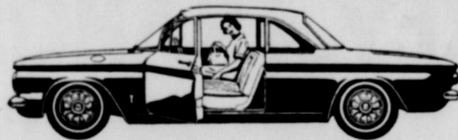
Chevy Corvair Monza Club Coupe

It'll pay you plenty to pad over to your Chevrolet dealer's One-Stop Shopping Center and get in on all the excitement there. Because Jet-smooth Chevrolets are outselling every other make of car, he's able to turn on the savings like nobody else in town. Have him fit you with an elegant Impala, a popular Bel Air or a budget-wise Biscayne. Or maybe with one of those six sweet-going, cargo-craving Chevy wagons. Just bring along your desire to own a lot of car at an easy-to-own price. Chevy and your Chevrolet dealer will look after the rest nicely, thank you. Jet-smooth Chevrolet