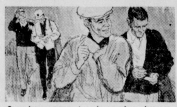
Some luxury compacts make you choose between your friends . . . and your luggage. But not the luxurious compact cousin of the Thunderbird . . . the new Falcon Futura.