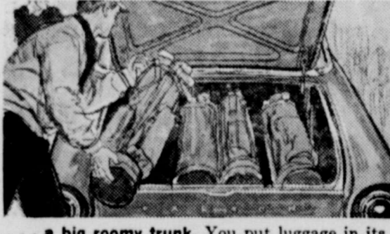
. a big roomy trunk. You put luggage in its place, not in the back seat which is reserved for your friends. Futura doesn't cramp your style