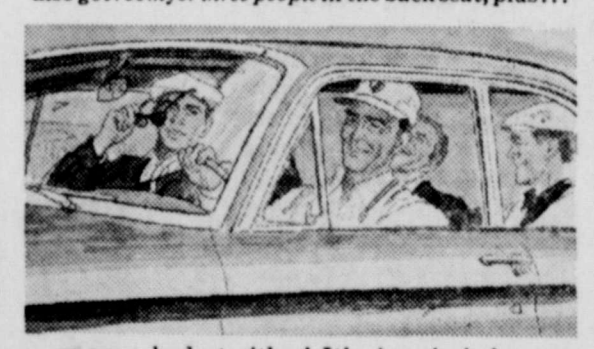
-or your budget either! It's America's lowestpriced * luxury compact. It costs you less to run, too. Read about Falcon economy below!

NOTE: Under the test conditions of the Mobilgas Economy Run, a Falcon, with standard shift, scored 32.6 miles per gallon . . . best gas mileage of any 6- or 8-cylinder car in the 25-year history of the Run! (Another Falcon was second, with 31.6 mpg!) Drivers of all cars were experts . . . and really out to win. But Falcon topped 'em all! *Based on a comparison of manufacturers' suggested retail delivered prices