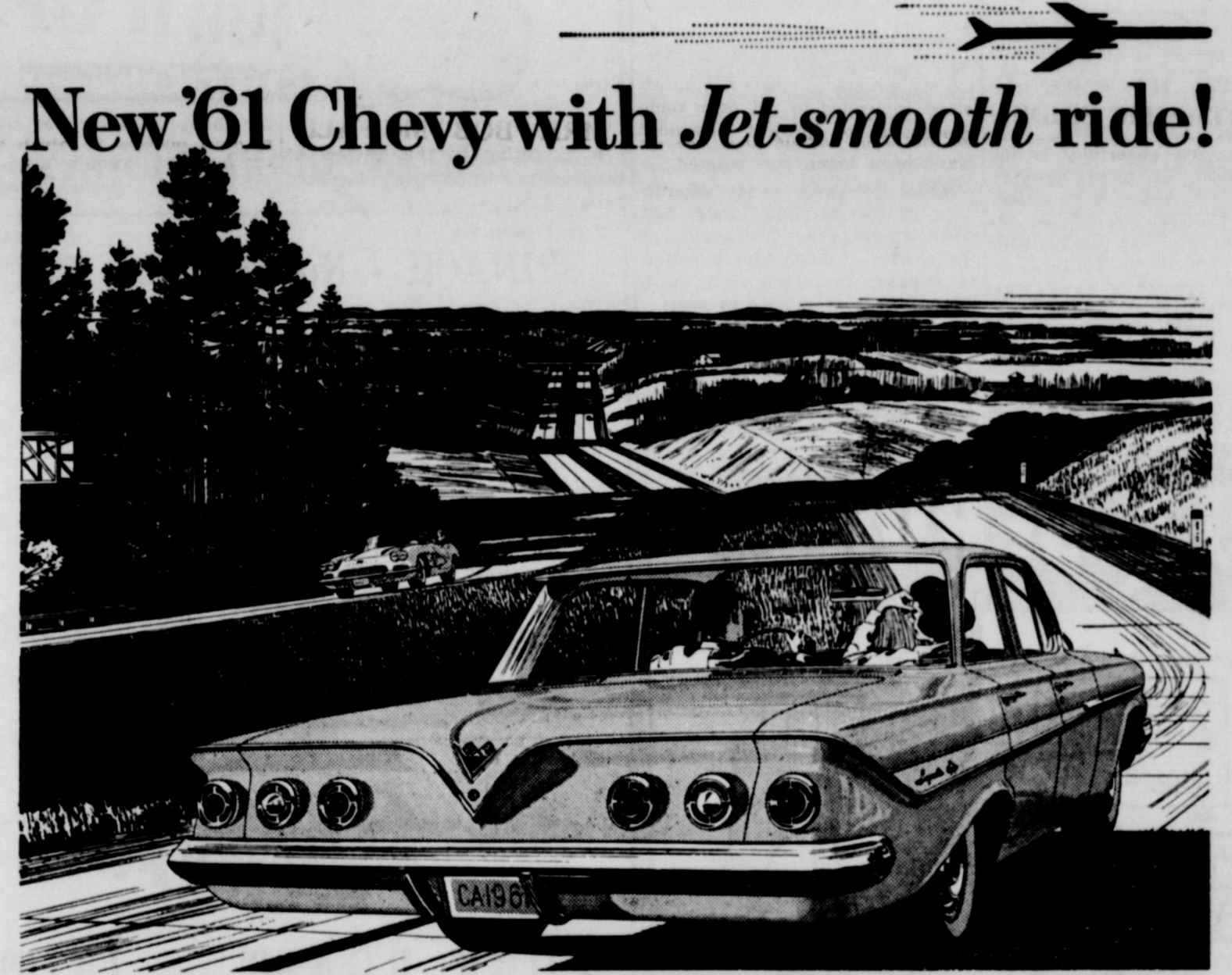
Impala 4-Door Sedan-Jet-smooth traveler that rivals the luxury cars in everything but price

The '61 Chevy loves to go because it goes so well. Purrs along pavements like a happy tabby. Takes rough roads in stride and all roads in style.