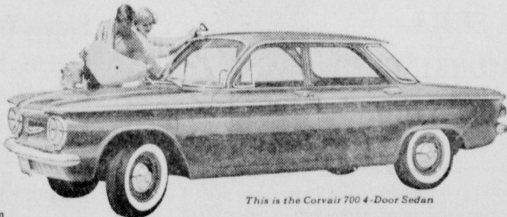
This is the Corvaire 700 4-Door Sedan

See Chevrolet cars, Chevy's Corvaire and Corvette at your local authorized Chevrolet dealer's