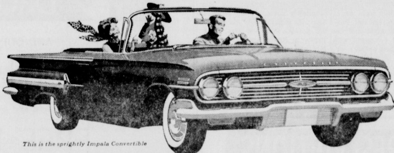
This is the sprightly Impala Convertible

to like what Chevy's got just as much as everybody else. (Especially the money you'll save.) Check your dealer on the details while there's still a wide choice of models.