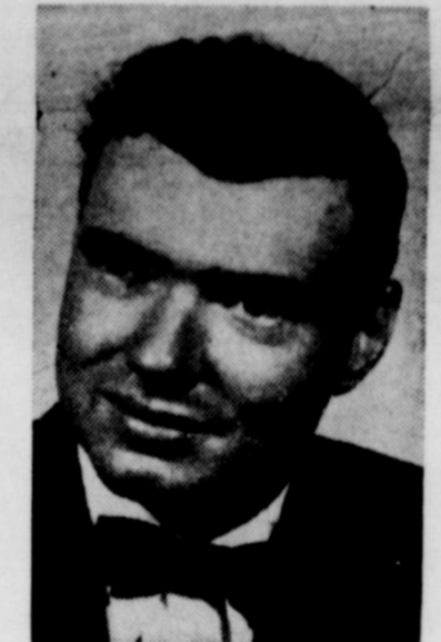
SAMMY BEAM Singer