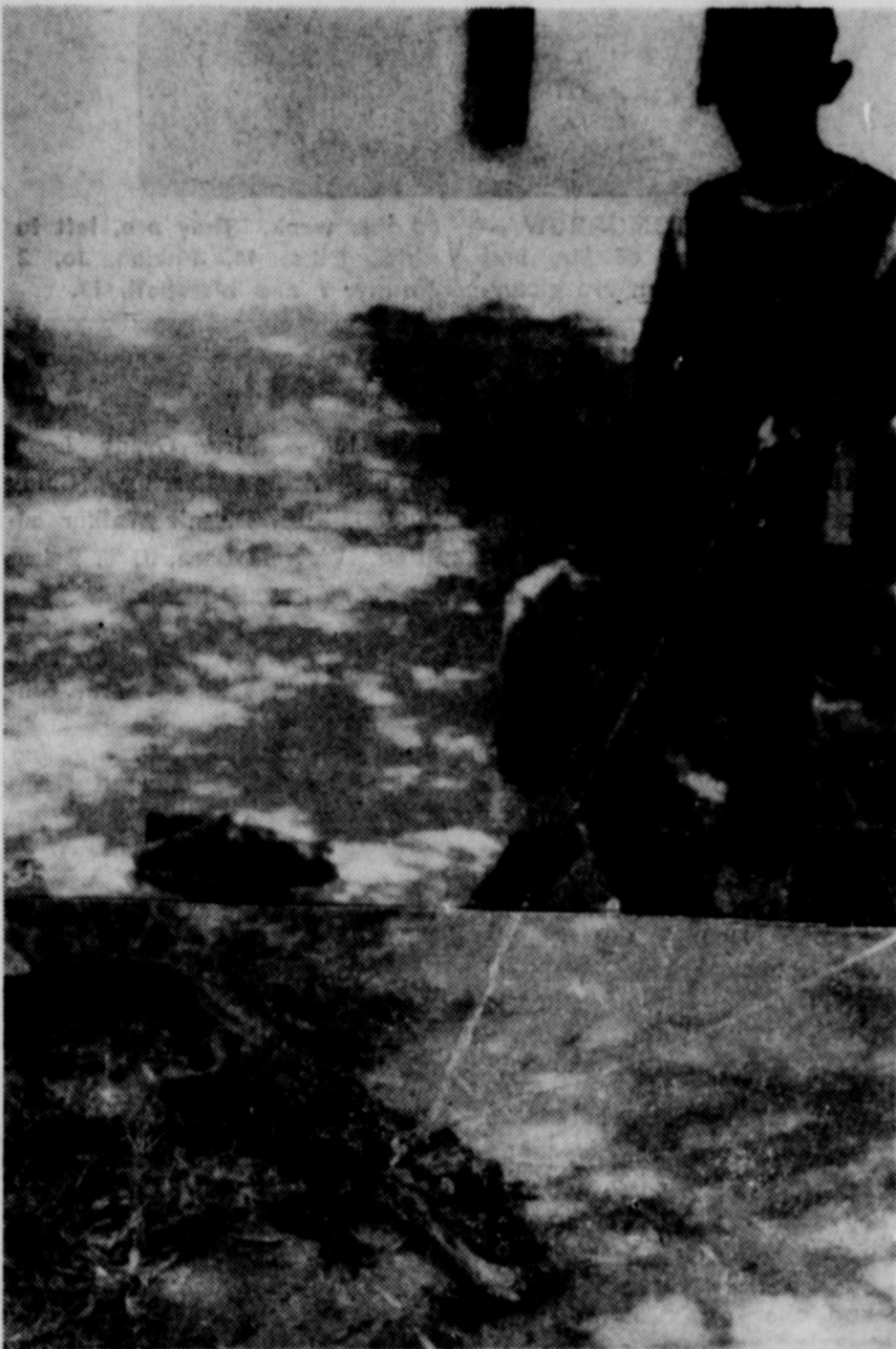
DOAK SNEAD AND PET(?)