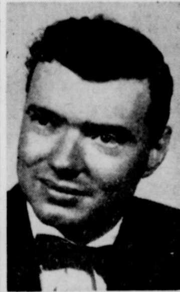
SAMMY BEAM Singer