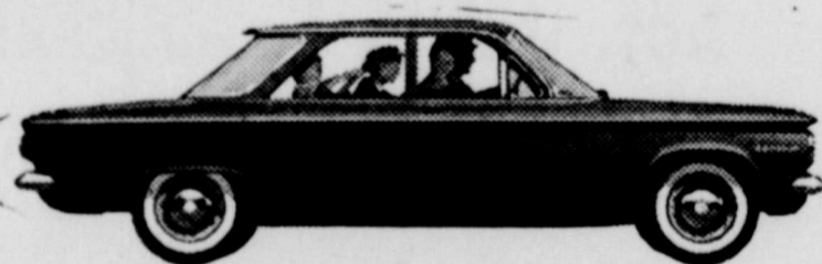
Corvair 700 4-Door Sedan

If you haven't driven it yet, you don't know what a delight driving can be. Its steering, response, traction and roadability are unique because it's a unique car — the only U.S. car with an air-cooled airplane-type rear engine, transaxle and independent suspension at all four wheels. Be in on the know. Find out what delightful differences this advanced design makes.